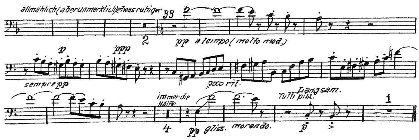
Mahler: Symphony No.5 - 3rd mvt.12 bars after rhl. 8 to 16 before rhl. 9

Mahler: Symphony No. 5 – 2nd mvt. rhl. 33 to the end